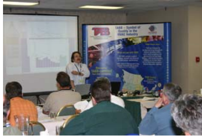
Sound and Vibration Class