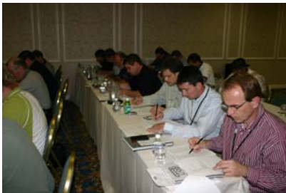
Customer relations training attendees.