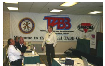
Informative afternoon packed with HVAC issues.