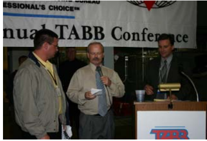
Vendors awarded prizes to those in attendance.