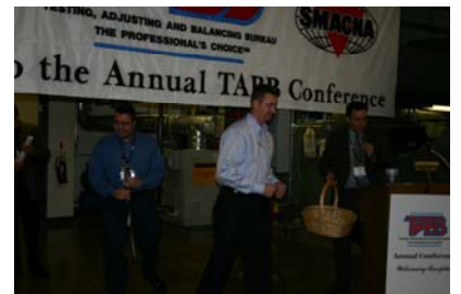
Attendees win equipment from vendors at tradeshow.