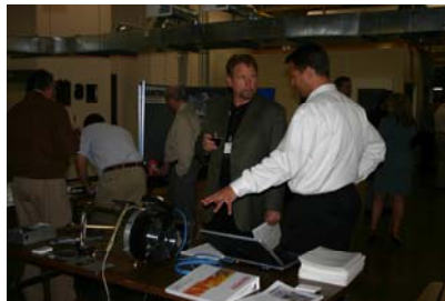
Tradeshow, Tour and Welcome Reception ChicagoLand