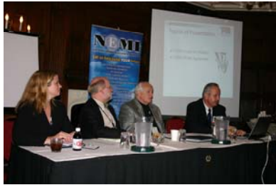
A breakout session for TABB Affiliates.