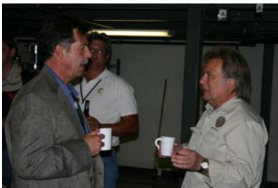
Tradeshow, Tour and Welcome Reception ChicagoLand