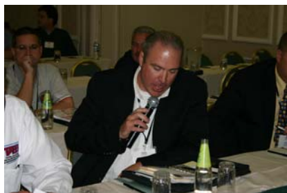
The open forum allows for a question and answer period.