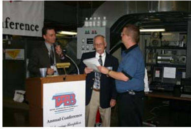
Vendors awarded prizes to those in attendance.