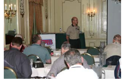
Customer Relations Training