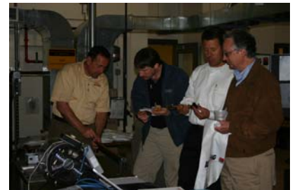
Tradeshow, Tour and Welcome Reception ChicagoLand