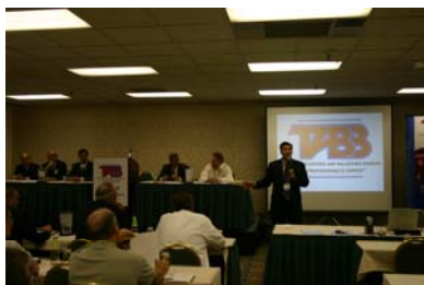
The ICB open forum.