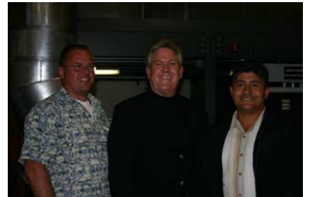
Attendees enjoy the networking atmosphere of the welcome reception.