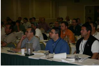
Sound and Vibration Attendees