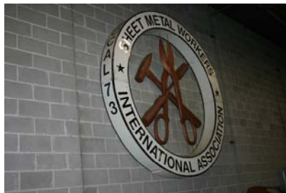
Tradeshow, Tour and Welcome Reception ChicagoLand